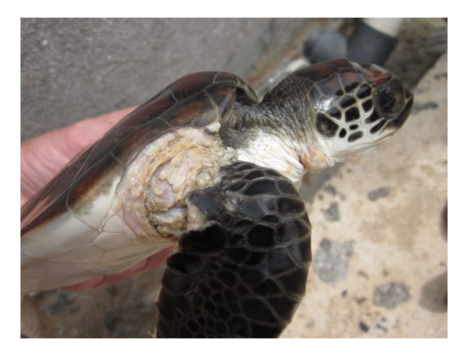
Fig. 2 Chronic dermatitis and at least one lesion that appears to be 'grey-patch' disease (herpesviral dermatitis of marine turtles, in particular, Chelonia mydas ).

(Table 4). The type and range of physical problems was extensive and included relatively mild but important issues (such as hypertrophic algal formation) through to severe injury, blindness and skeletal defects from management or genetic factors. Hypertrophic algal formations were commonly present on the shells and limbs of turtles (Fig. 1). Chronic dermatitis and apparent 'grey-patch' disease were, likewise,