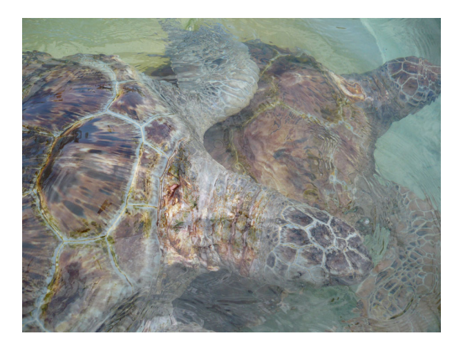
Fig. 9 Dorsal neck lesion from bite injuries.

A recent (2012) CTF-sponsored investigation of the farm reported the following issues: concern at the incidence of skin lesions and early juvenile mortality levels; a