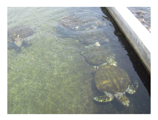
Fig. 1 Green turtles (Chelonia mydas), each with multiple bite wounds and showing hypertrophic algal formation in algal growth.