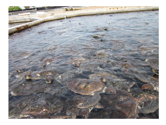
Fig. 8 Overt-overcrowding in one of the main production ponds off-public view.

incorporates both multiple-occupation ponds in addition to interconnected ponds using shared water systems. This questionable arrangement includes introduced direct risk of cross-contamination of potentially pathogenic microbes and macroparasites to many animals and represented a persistent and enduring animal health risk.