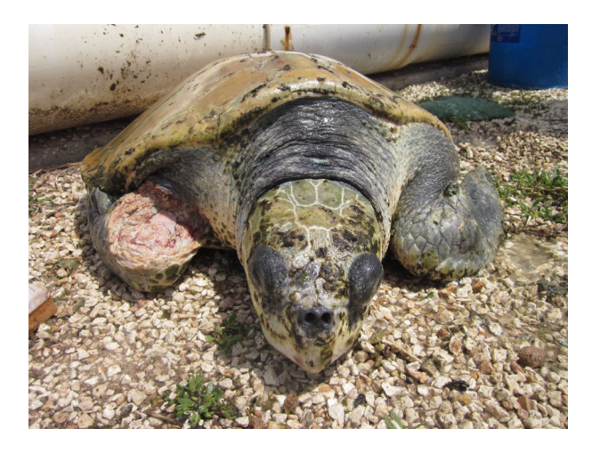
Fig. 4 Kemps ridley turtle ( Lepidochelys kempii). Massive bite wound to the dorsal surface of the right foreflipper.

commonly noted (Fig. 2). Many turtles, particularly juveniles, manifested major injuries, particularly to their soft tissues, including missing limbs (Figs. 3, 4). Some juveniles had lost all four limbs, others, for example hatchlings, were seen floating unresponsive in the hatchling tank. Management- (for example, poor incubation) or genetic-related defects were occasionally observed (Fig. 5).