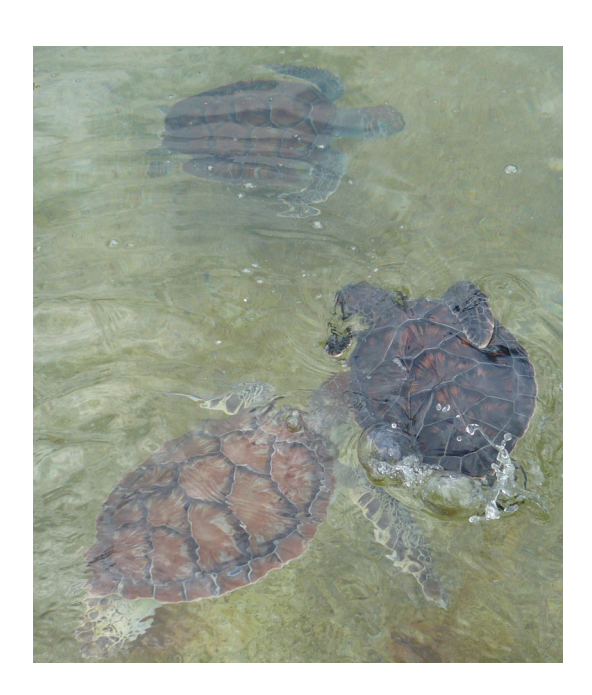
Fig. 11 Co-occupant aggression in juvenile.

notable proportion of severe skin lesions including deep ulceration to the shoulder, forelimbs, head and hind limbs; high mortality levels in younger classes; potentially emerging enteritis conditions; and a notable apparent proportion of moderately emaciated animals (Balazs et al. unpublished). Those findings further confirm aspects of our assessment of the WSPA (unpublished) evidence regarding ongoing presence of important disease at the facility. The CTF itself reports mortality-rates during the years 2007-2011 at: 2007=4.4%; 2008=5.4%; 2009=7.2%; 2010=4.9%; and 2011=8.1% (CTF FOI declaration to WSPA 2012).