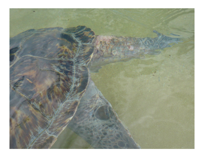
Fig. 10 Tail lesion from bite injury.