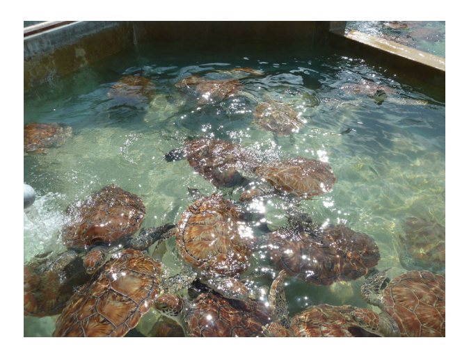
Fig. 6 Green turtles ( Chelonia mydas ) in densely populated ponds common showed signs of captivity stress including hyperactivity, boundary exploration and co-occupant aggression.

Prevalence guide: 'Rare' = 1–5 %; 'Occasional' = >5–20 %; 'Frequent' = >20–35 %; 'Common' = >35–50 %; 'Extremely common' = >50 %