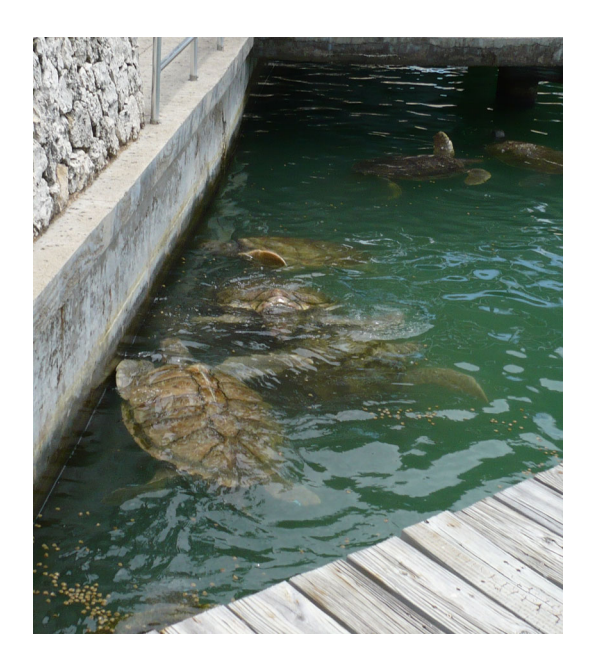
Fig. 12 Captivity-stress-related boundary exploration among the adult breeder population.

In nature, green turtles are largely solitary animals that occupy large spatial ranges, and diverse and stimulating environments. Important essential innate drive states and biological needs cannot be provided for in the highly limited captive