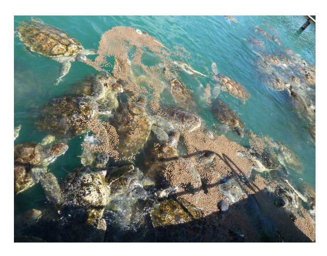
Fig. 7 Green turtles ( Chelonia mydas ) in 'breeder' lakes manifested signs of captivity-stress in particular competition-stress and co-occupant aggression during feeding frenzies.